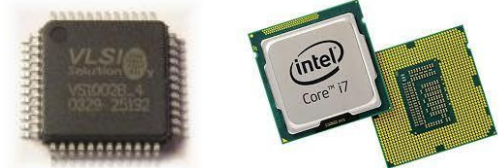
LSIC (Large Scale Integrated Circuits)